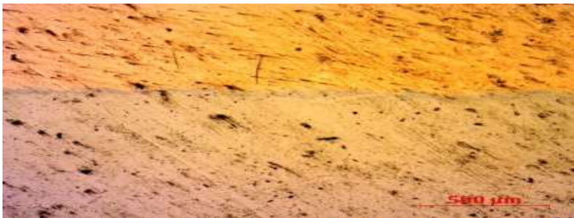
Fig. 4 Optical image of interface between Cu-Fe sample with 5 ton