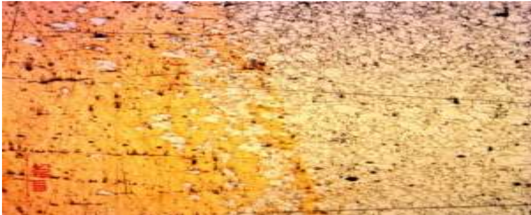
Fig. 1 Optical image of interface between Cu-SS sample with 4 ton

Form the figure 1 microstructure it can be watched that there is no vicinity of splits in all the joints. It was watched that with the increments in compaction load there is a superior bonding between the joints. Microstructures couldn't affirm any vicinity of Intermetallics.